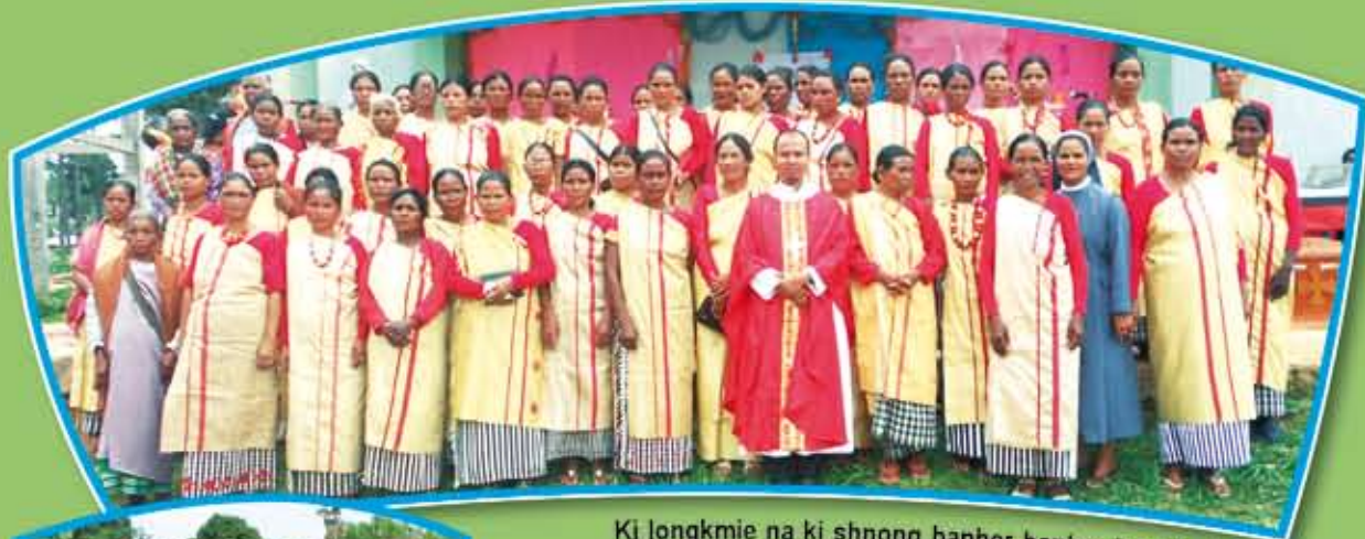
Ki longkmie na ki shnong bapher bapher jong ka Parish kiba la iawan ban leh riewblei bad pyndonburom ia ka Maria ka Kmie u Blei