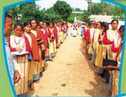
Ki longkmie ha ka riam tynrai ki la rah donburom ia ka dur Maria sawdong ka shnong Barato