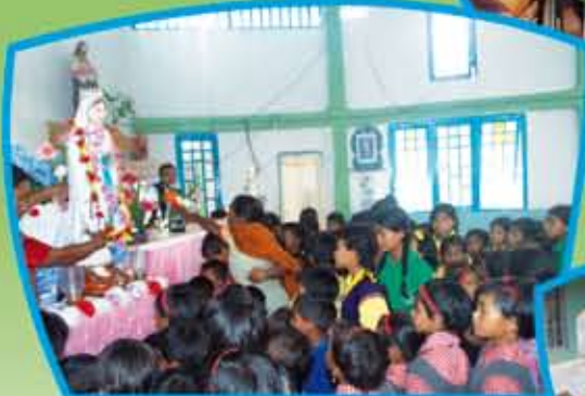
Ki khynnah skul ka St. Peter Secondary School Barato kiba dang pyndonburom ia ka Maria ka Kmie u Blei